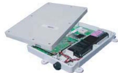
Measurements: 9.25" X 6.25" X 1"